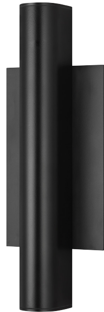
CHARA 12 WALL shown in black

* Visit techlighting.com for specific warranty limitations and details.