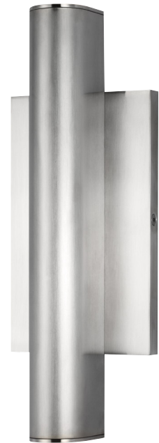
CHARA 12 WALL shown in satin nickel