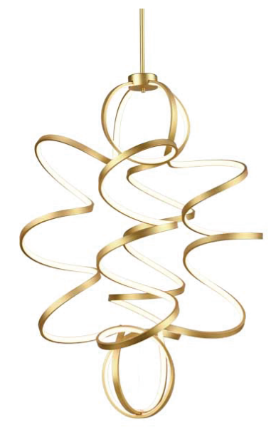
AN - Antique Brass