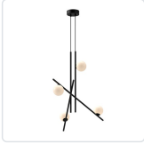
CH89832-BK/GO Black/Glossy Opal Glass