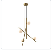
CH89832-BG/GO Brushed Gold/Glossy Opal Glass