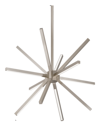
BN - Brushed Nickel