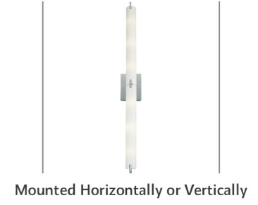
Mounted Horizontally or Vertically