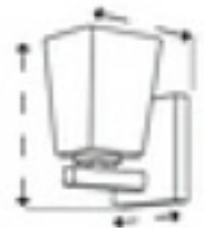
Image File Name: P5046-077.jpg