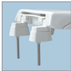
2" LIFT HINGES AND BUMPERS