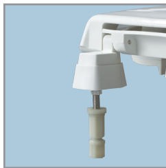
STA-TITE® COMMERCIAL FASTENING SYSTEM™